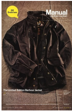
50 Embroideries Manual The Limited Edition Barbour Jacket