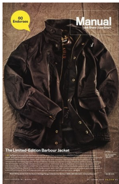
50 Embroideries Manual The Limited Edition Barbour Jacket