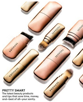
PRETTY SMART The latest beauty products and tips that save time, money, and—best of all—your sanity.